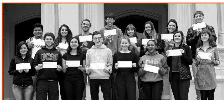
2017 Fleck Scholarship Recipients