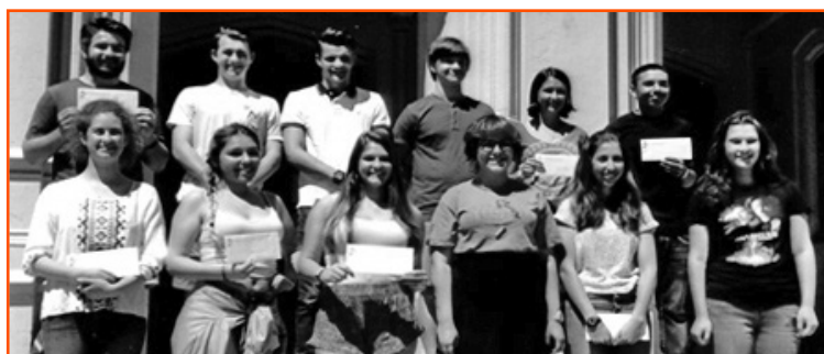
2017 Memorial Scholarship Recipients