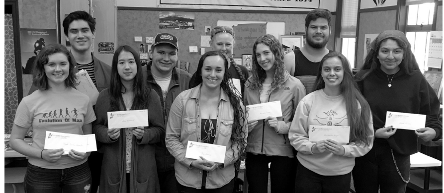
2018 Memorial Scholarship Recipients