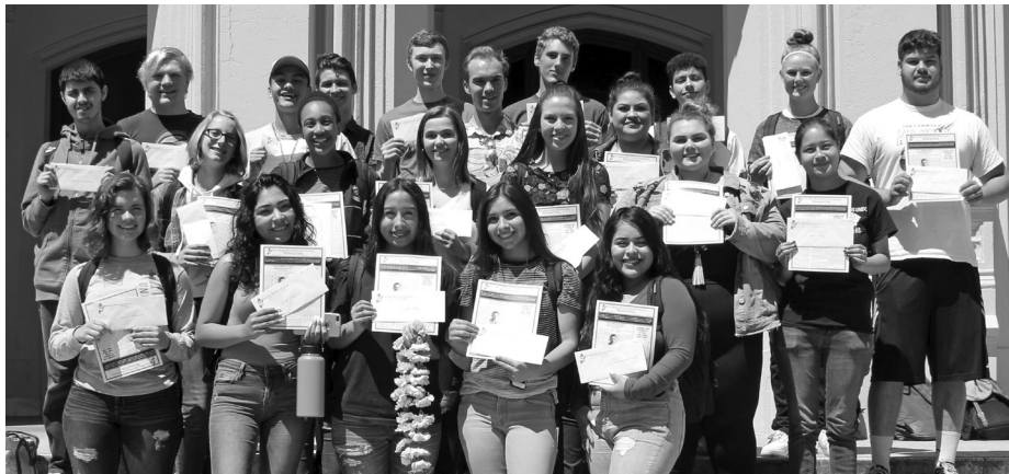
2018 Fleck Scholarship Recipients

been so fortunate to meet through this process have been outstanding. These exceptional students all expressed their love for SRHS, something we like to hear. Please read their names below and enjoy knowing that the Foundation, with your help, has made this possible.