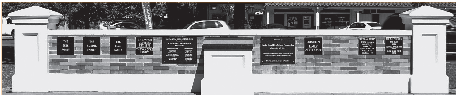
Back of Sign