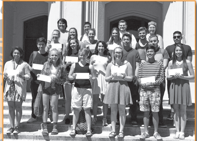
2016 Fleck Scholarship Recipients