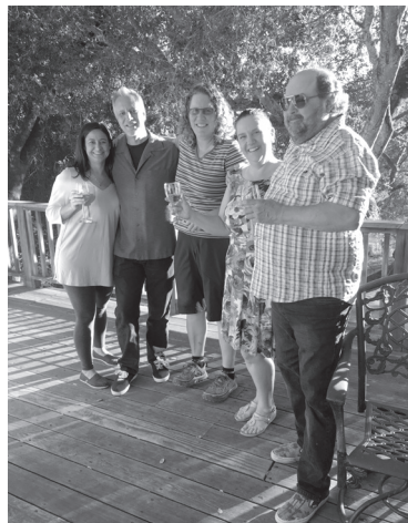
Auction Dinner Attendees