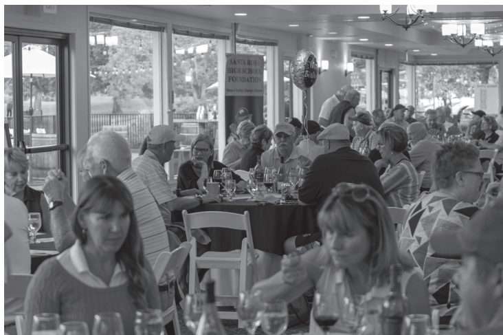
Golf Tournament Banquet