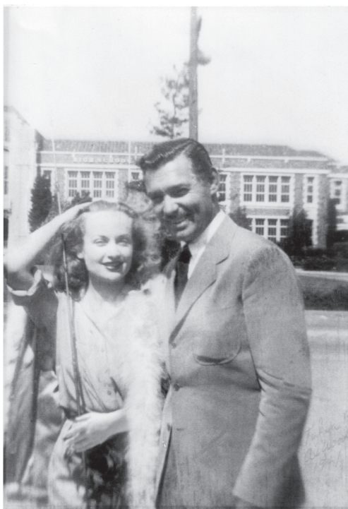
Carole Lombard, Clark Gable, and SRHS, 1940