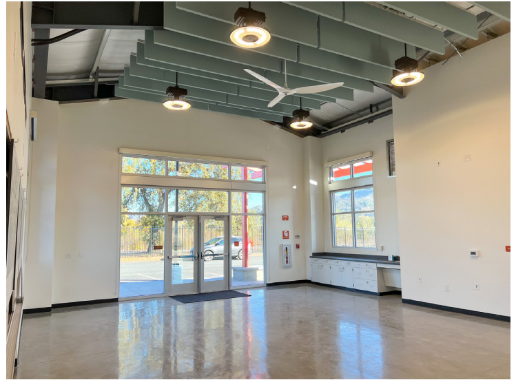
Educational meeting space

will recognize the great contributions from Raley's and the Alvin Hampton Foundation