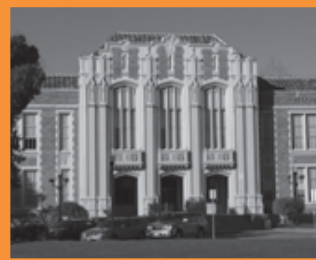
Since 1925, SRHS's home - www.srhsf.org

The primary objectives and purposes of the Santa Rosa High School Foundation are to serve as a charitable organization to unite SRHS graduates, parents of current and past students, faculty, staff and interested community members for: