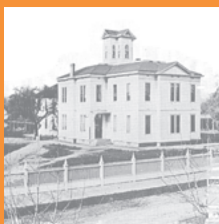
Fremont School - the original location for High School in Santa Rosa - Echo 1932

The shortage of gasoline two years earlier was still a strong memory, so the auto manufacturers came out with high mileage cars like Mustang II, Maverick and Chevy Chevette. Although gas was 61 cents a gallon, the lines to fill up were not like they were. You could buy a used '74 Pinto Run-about for $2995 at Niles Buick. Or a sexier '75 Plymouth Duster for $4388 at Bishop-