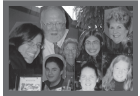
Some of the December Student of the Month Lunch attendees

This is just one of the ways the SRHS Foundation supports the students of Santa Rosa High School. It is one of the most important and favorite ways of showing support to the students.