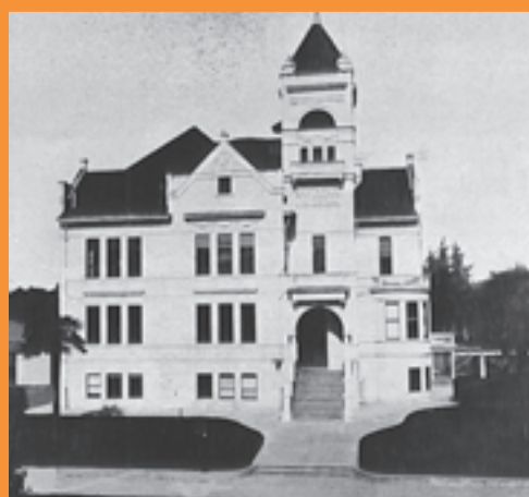
The original Santa Rosa High School - it was consumed by fire in 1921- Echo 1932