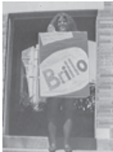
"The Brillo Pad"