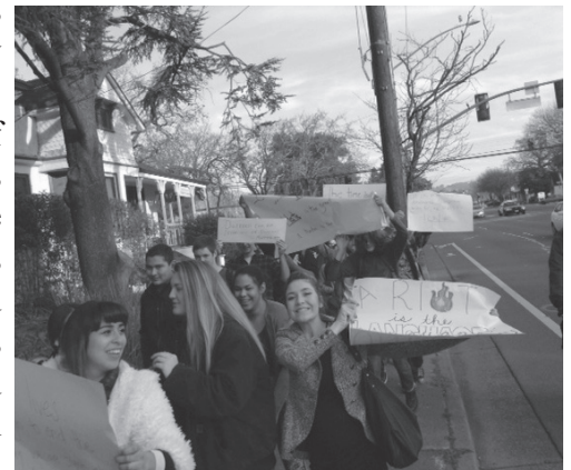
SRHS Juniors recreate the Selma March to the Roxy.

The SRHS Foundation has a mission to support the educational, athletic, artistic and community-focused projects developed by the SRHS staff. It's one aspect of the Foundation's goal that the board of directors are most proud of, because it has an immediate and positive effect on the students.