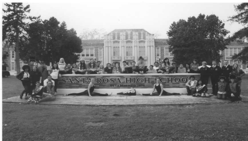
SRHS students pose at the Foundation-sponsored sign.