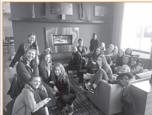
Journalism and Yearbook Students hit Seattle