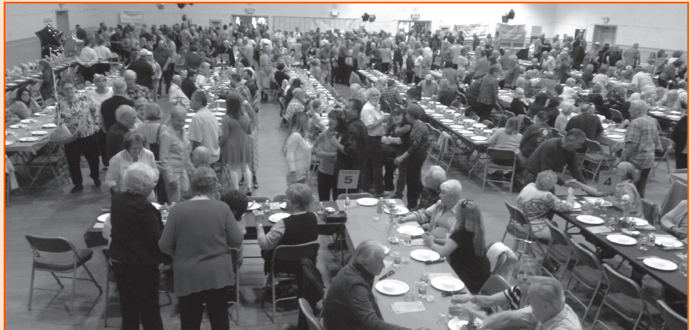
Getting seated for dinner, 2019