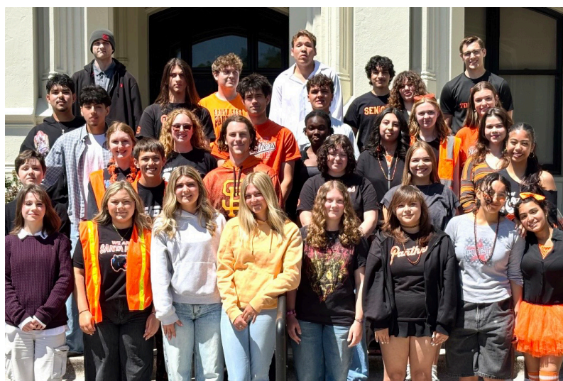
Memorial Scholarship Recipients