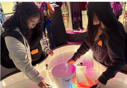
Eighth graders have fun with science at S.F.'s vast Exploratorium

Through May of this year, the Panther Project Fund has awarded grants totaling $81,758 in requests from staff, teachers, department heads and clubs. The PPF Committee meets on the first Friday of each month, starting in September and ending in May. We are currently meeting at 6:30AM at the I-Hop Restaurant on 4th Street. Below