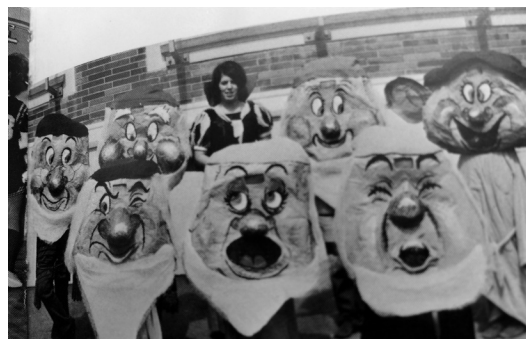
Snow White and the Seven Dwarfs

To this day, one of the group (if not all of the group) is very upset with the Vice Principal's decision. 1969 saw four guys attached at the hip, literally. A father owned a moving and storage company and provided four uniforms. A mother sewed them all together. Since each guy had a different class schedule, the group had to scramble to report en masse to be in attendance. 1972 saw one of the most original – and stinking – costumes of the period. A senior boy came as a sea creature. He went out to the Sonoma Coast and gathered a reeking mess of seaweed. With a lot of twine he put the costume together. The finishing touch was an ocean water spray to give it an overwhelming