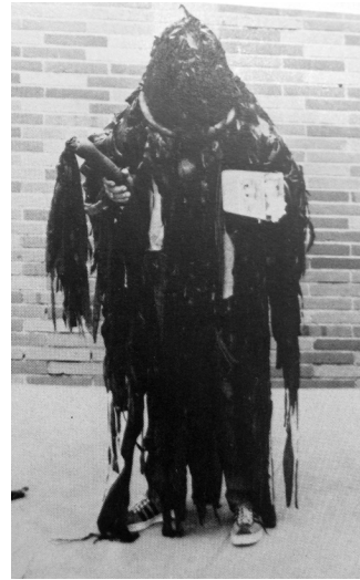
The Sea Creature

Wizard. They all carried crosses and wore medallions. In poor decision making rivaling their own, school administrators didn't send them home. They were allowed to wear the costumes after they were told to cut away the