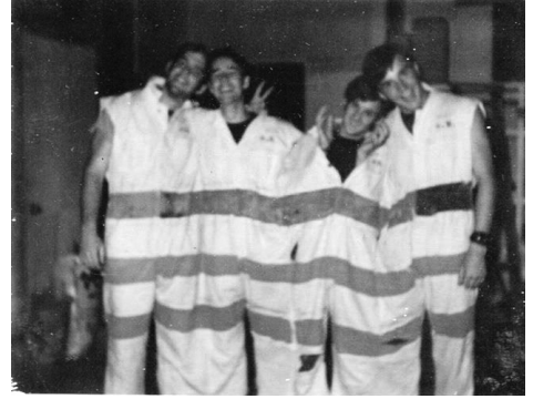
Four Guys, One Uniform

The sea creature costume wasn't the worst decision made by participants for senior character day. Not by a long shot. In 1967 a bunch of guys dressed up as Ku Klux Klan members. One even came as the Imperial