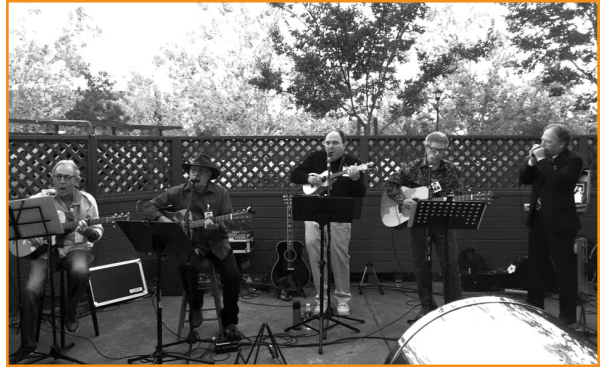
Classmates rock in their 50th reunion