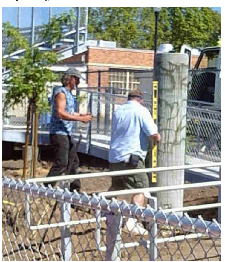
Bottom pole section, 30 feet deep

Within three years, the coalition of groups had repaid the entire $80,000 loan. Now, 18 years later, the lights at Nevers Field illuminate every SRHS football home game, and many other evening and night events. Large regional track meets can take place, and outdoor winter practices can go longer in spite of the fading daylight. The lights even illuminated last year's Covid necessitated Prom. All these events are possible because of the money, work, and dedication of a civic army with a dream 20 years ago.