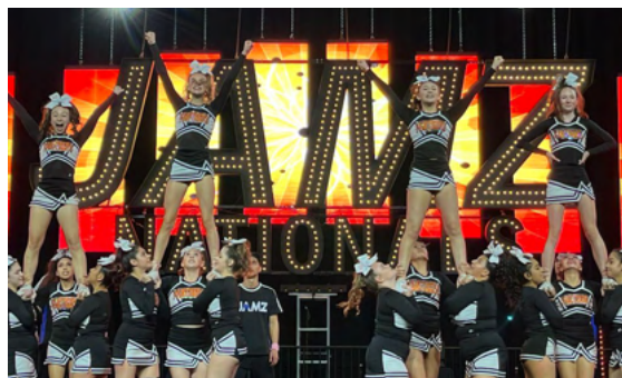
SRHS Competition Cheer Squad at Nationals

It probably comes as no surprise to many of our readers that cheerleading grows in stature every year. Simple chants of "Rah, Rah, Rah" have given way to very exciting, gymnastic performances that sometimes rival the action on the playing field. Many school districts are now including Cheer in their athletic programs – and that means access to funds. That hasn't happened yet in the Santa Rosa City Schools District. But that hasn't stopped SRHS's cheerleaders from fielding two outstanding teams – a sideline performance squad of 65, and a competition squad of 17.