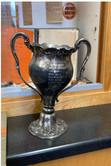
1897 trophy found in a lettuce field