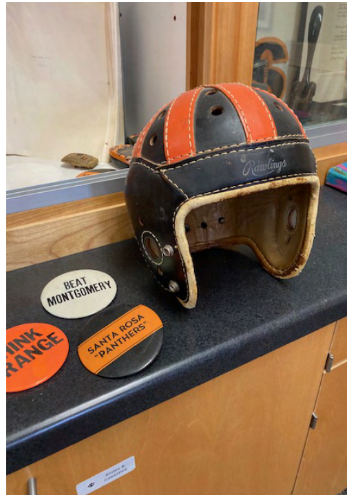
once "liberated" Panther football helmet

Every museum artifact has a story and sometimes that story is personally significant. At the beginning of the school year, the social science department cycles all sophomores through the museum. Yearbooks from the past are there for leafing through, and students delight at seeing hairstyles and clothes from the past.