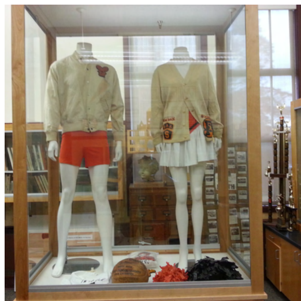
Vintage cheerleader outfits