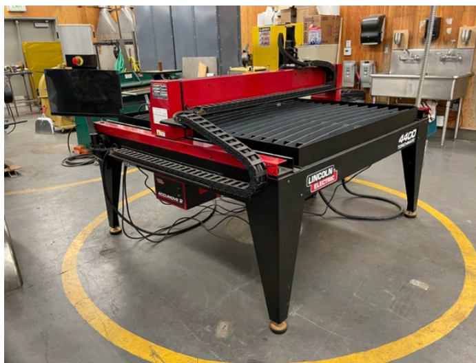
In case you're wondering what a $30,000 plasma cutter looks like

fume hood. It uses plasma gas to cut steel and is programmed to move in an exact pattern. Gutsch says, "It's a misconception that we're operating with tools of the 1930s and 40s. In reality, a tremendous amount of technology is in the CTE classes."