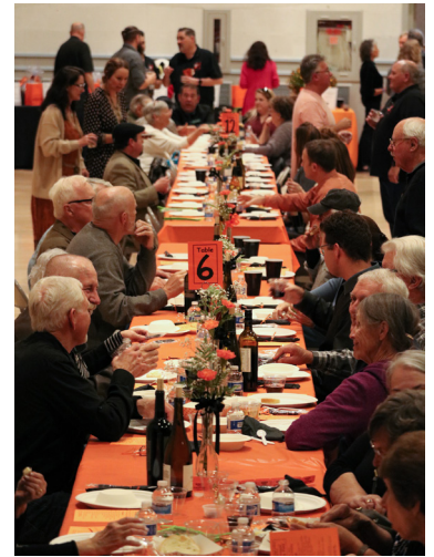
Section of Polenta Feed 2022, the first post pandemic Feed