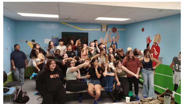
SRHS Choir enjoying fun time together