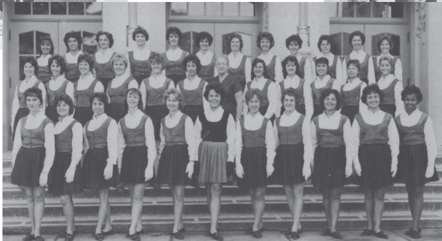
Pantherettes Precision Drill Team, 1961