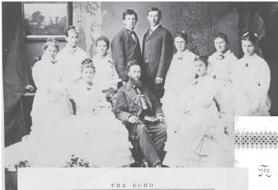
First SRHS Grads, 1878